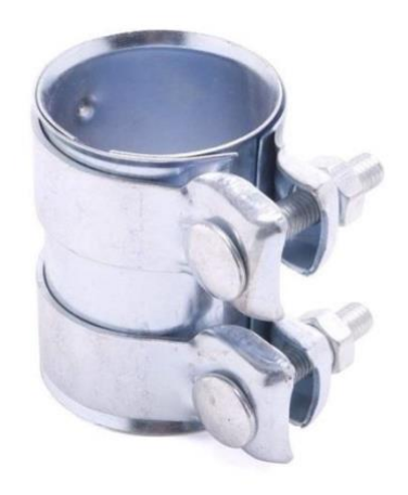
Universal Exhaust Pipe Sleeve Clamp

The overall length/bore of the exhaust centre pipe must not be altered. It is permitted to use a Universal Exhaust Pipe Sleeve Clamp as shown below or make a slip joint.