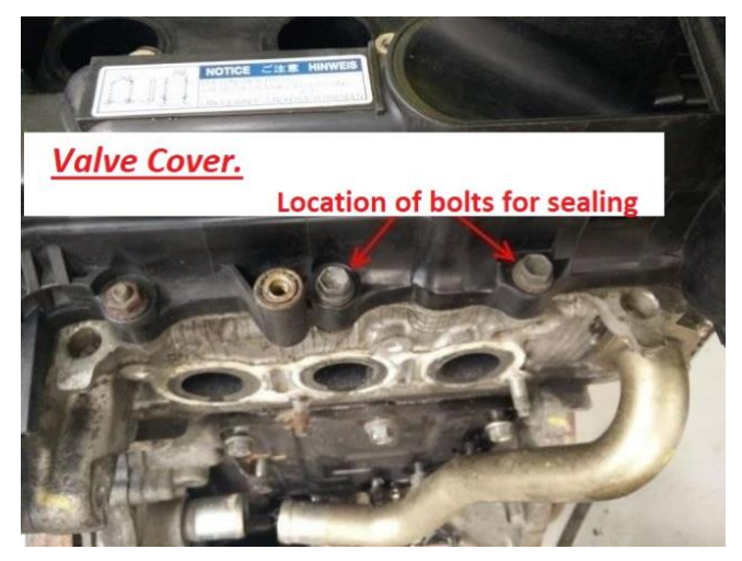
Photograph shows the location of the valve cover bolts.

To allow a Motorsport UK Scrutineer or C1 Club Racing the option for an engine to be sealed prior to inspection, Two bolts at the front of the valve cover must be cross drilled or replaced by competitor supplied drilled bolts. These two valve cover bolts may be wired together and sealed by a Motorsport UK Scrutineer or their appointed assistants (Motorsport UK General Regulation G.1.1.2), or by C1 Racing Club personnel in relation to fitment of C1 Racing Club seals (5.2.2.5 - 5.2.2.6). The engine will be made available for inspection at any future time as specified by the Motorsport UK scrutineer, or in relation to C1 Club seals, as requested by the C1 Racing Club.