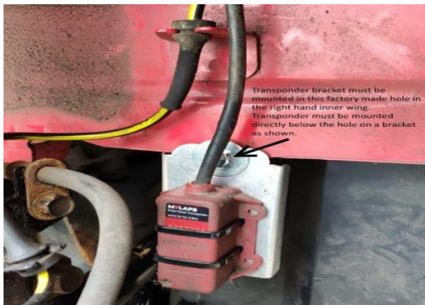
See 14.1.2 for wiring regulations.

5.6.3.13 The mandatory TSL lap timing transponder must be fitted to the front inner (right side) flitch panel in the position shown below: